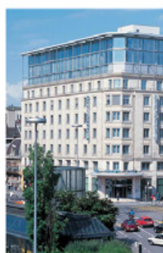
HÔTEL CORNAVIN ****