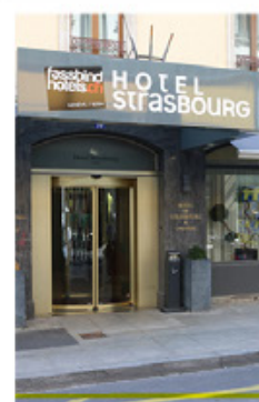
HÔTEL STRASBOURG ***

AMBASSADOR **** CITY AM BAHNHOF *** CORNAVIN **** CRISTAL (DESIGN) *** STRASBOURG *** LES NATIONS ***