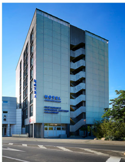
HOTEL AMBASSADOR ****