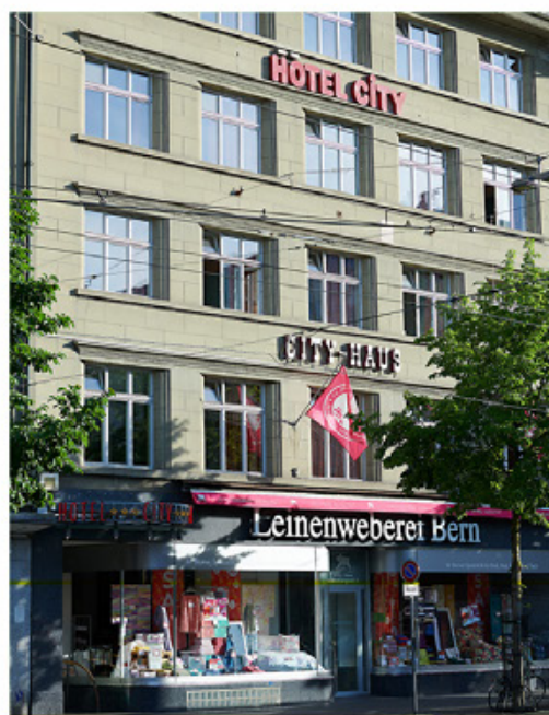
HOTEL CITY AM BAHNHOF ***